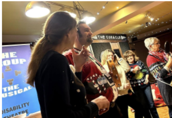
The Coracle, Sunday 7th December