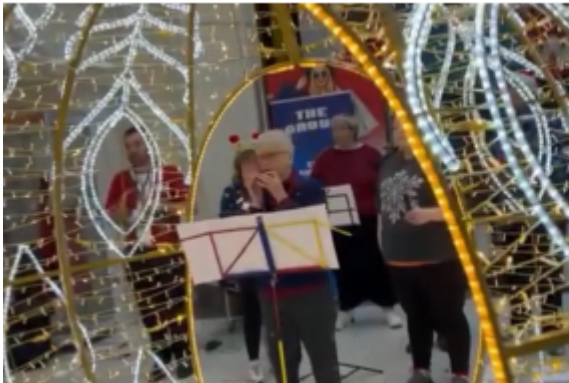
The Darwin Shopping Centre, Shrewsbury, 2025 Saturday 6th December 2025